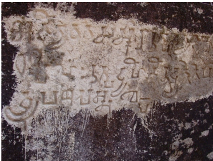
Fig. 6 Khazana Ghat Inscription-III