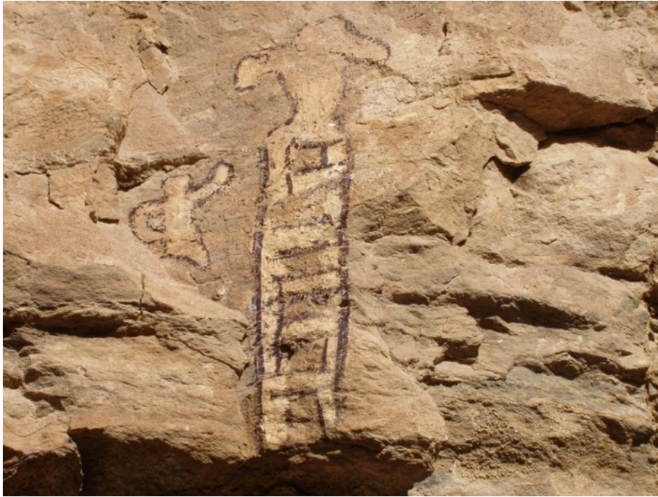
Fig. 3 Painted shelter of Kaferi Smasta

Human figures of the lower register are standing in the front in varying positions. All figures are with opened wide hands and legs. It seems that they are celebrating a hunting scene. The technique most commonly used for the painting is that of outlined figures, but human figures are more realistic on the wall of the shelter. All the human figures hold a weapon, a tool; bow and arrow, or a club in their hands. The human figures of KaferiSmasta reveal resemblance to the painting of Dwolasmane-patai shelter of Kandag valley (Oliveri 2005:220).